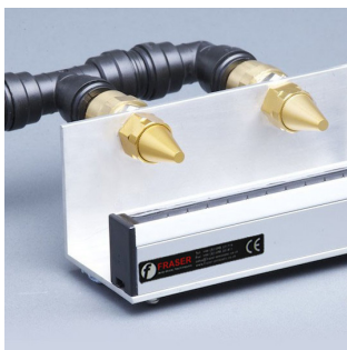
4200 Ionised Air Nozzle

Fraser offers a range of manual and automatic cleaning options which include ionised air guns, nozzles, compressed airknives and fan-driven airknives.