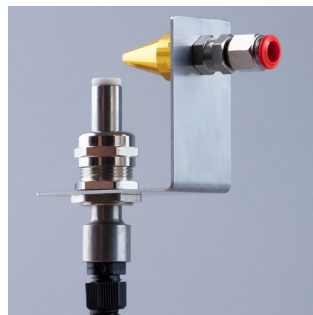
4200 SP Ionised Air Nozzle