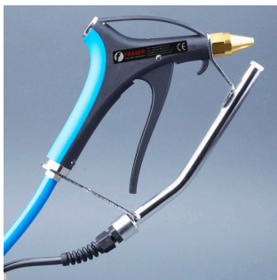
4110 Air Gun