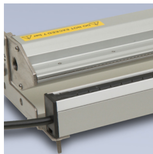
5100 Ionised Airknife